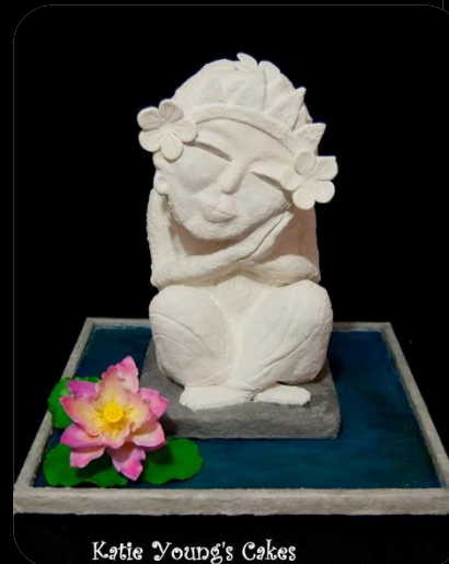
Katie Young's Cakes

Complicated 3 D Sculpted cakes serving 20 (Cars/Trucks/Trains/ Animals) from $400+